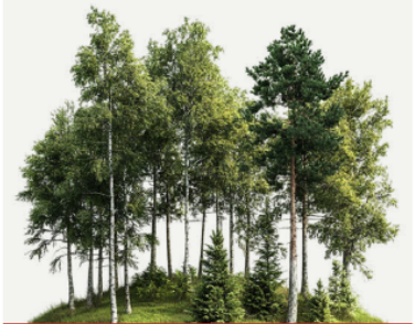
Nationwide community forests

“Love the Forests and the Community Project”, in cooperation with the Department of Royal Forest and community forests across the nation, is aimed at promoting and supporting community engagement in the management, development and rehabilitation of forest resources under the Sufficiency Economy Principle guided “sustainable forests for community benefits” target as forests can be the source of food, water and resources for community. It also supports the national strategies in increasing forest areas and achieving carbon neutrality in 2050 and net zero emissions in 2065 as well as SDG 13: Take urgent action to combat climate change and its impacts.